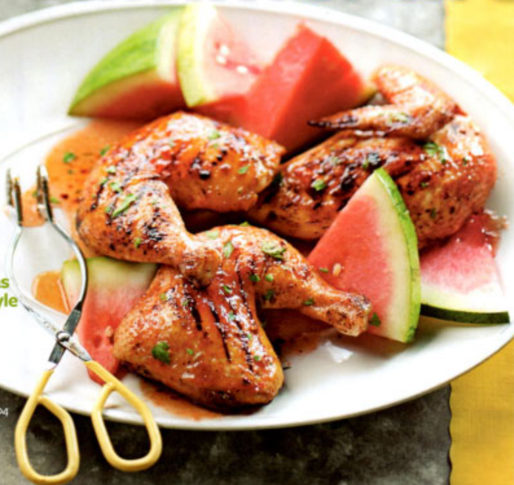
Grilled Chicken with Watermelon Glaze P.204